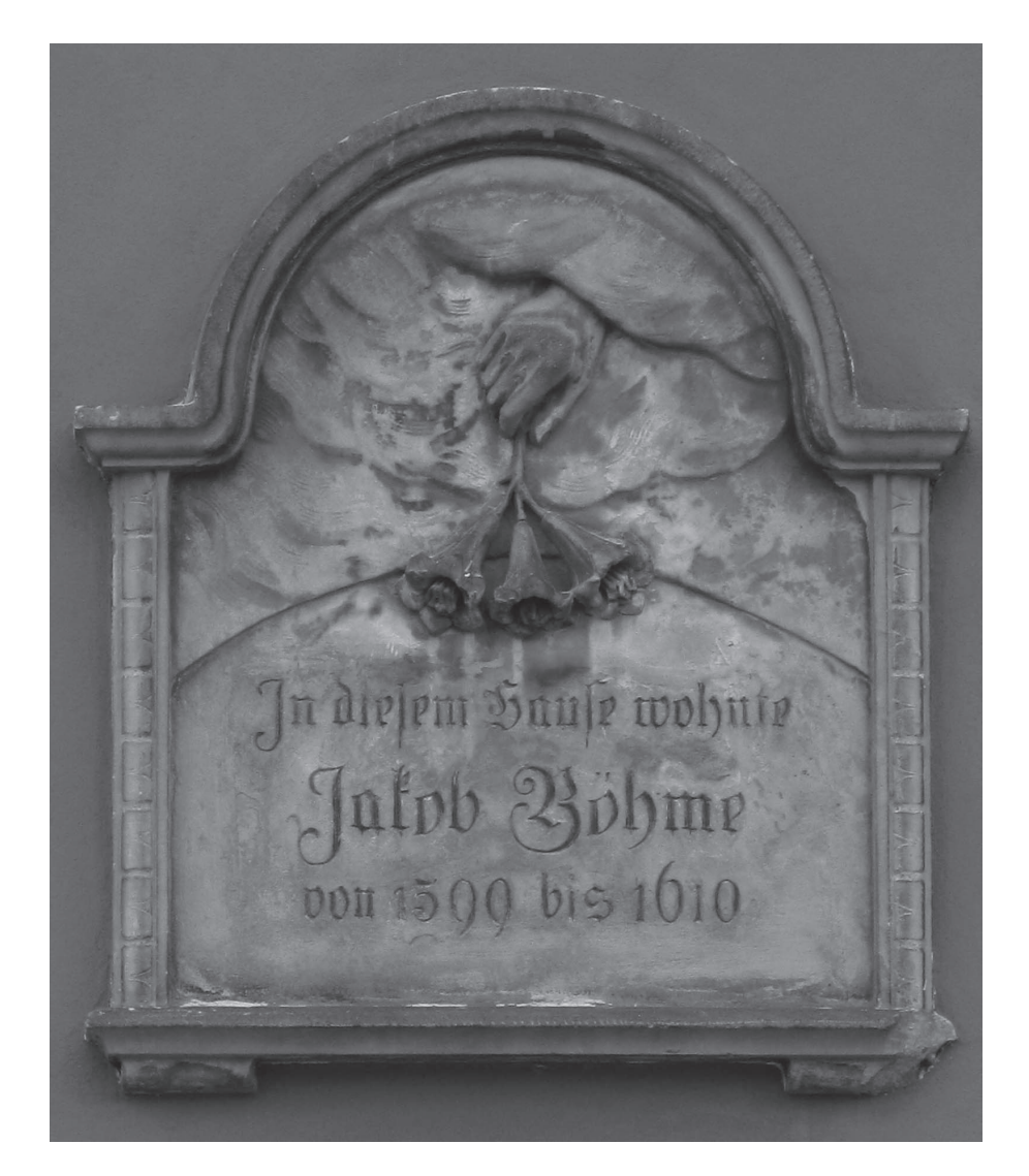
Figure 2.2 Plaque placed by the Oberlausitzische Gesellschaft der Wissenschaften outside Boehme's house on the tercentenary of his death in 1924.