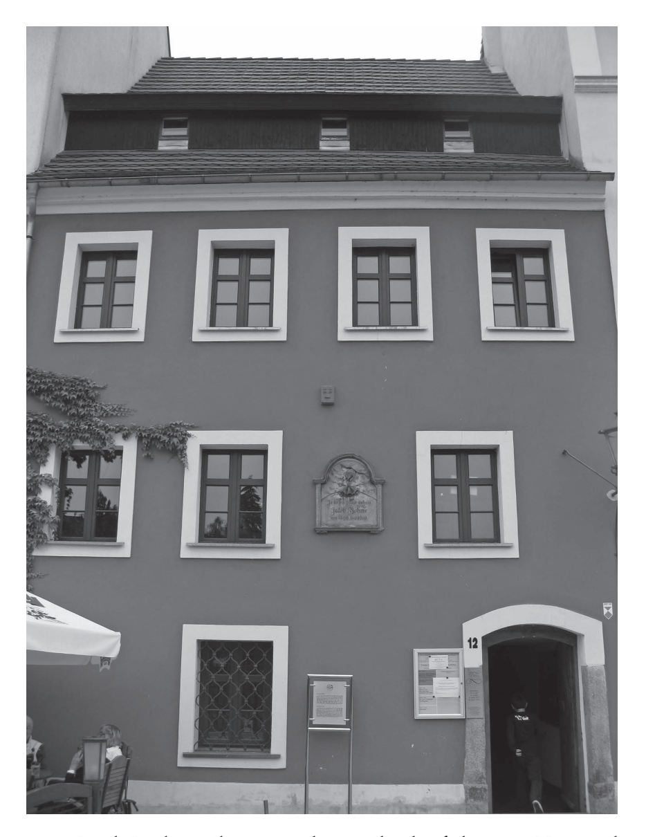
Figure 2.1 Jacob Boehme's house on the east bank of the river Neisse where he lived between 1599 and 1610. The property has undergone restoration since then and today houses a small museum in Zgorzelec, Poland.

If the latter sketch is trustworthy, it represents an impecunious individual. While Boehme had evidently enjoyed a period of prosperity and indeed inherited half his father's estate in 1618, he apparently soon forsook his trade, devoting himself with little distraction to his calling. During intermittent periods of deprivation and devastation following the outbreak of