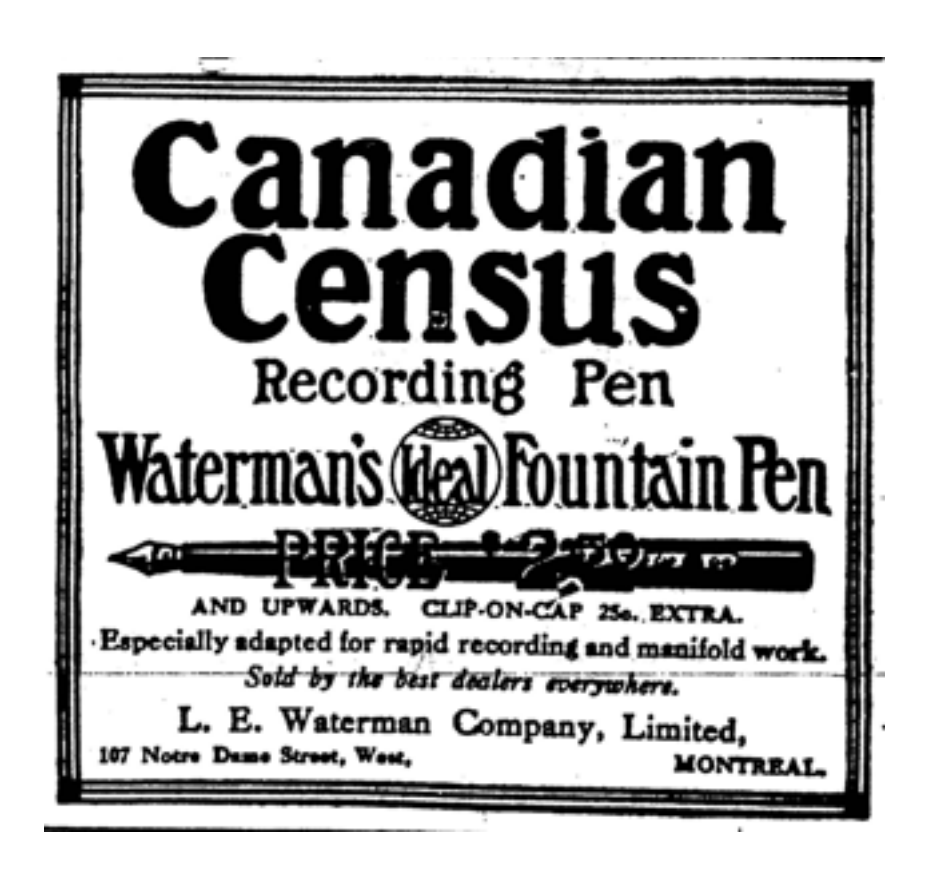
Figure 3.2. Advertisement for "Canadian Census Recording Pen."

Enumerators were instructed "to make all entries on the schedules in ink of good quality," and so a pen was clearly a requirement. The "Canadian Census Recording Pen," a fountain pen designed by Waterman's in 1911, was advertised in the Toronto Daily Star , and perhaps was utilized by enumerators<sup>34</sup> (see Figure 3.2). The description that it was "especially adapted for rapid recording and manifold work" suggests that it was functionally intended to be.