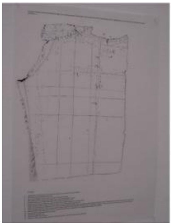
Fig 2 Map detail of back bodice ©Deb Roberts The maps added a visual representation of the information held within the fabric, and a means to engage the audience with the past by revealing detail that is hidden within the material.