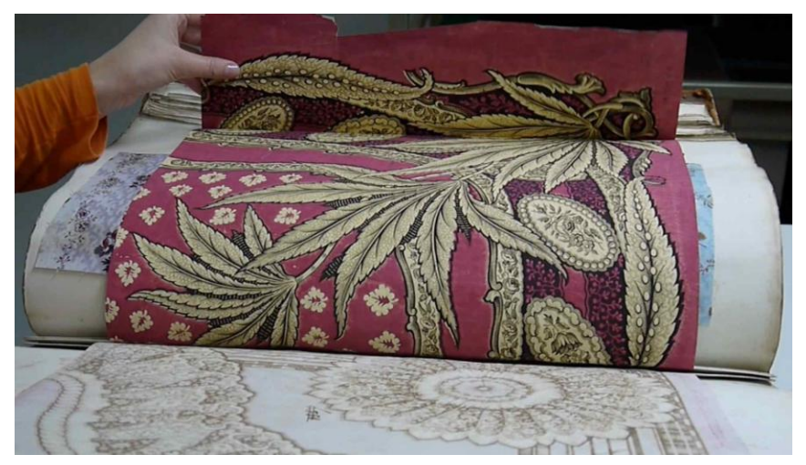
Still from: The Volunteer Experience (Brass 2013): examining kerchief designs.