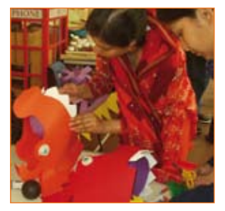
Parents in school making costumes

tracking, finding this allowed them creative release; others thought assessment would confer gravitas.