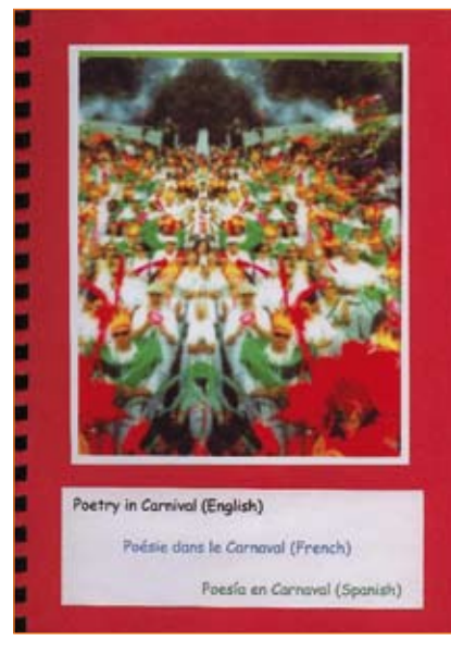
Poésie dans le Carnaval - book made by MFL students