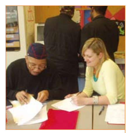
Collaboration with artists was the key

their work with children and record their work in schools. Some teachers contributed extensively to this process. Recording of artists workshops in college and in schools helped artists reflect back on their work and on student learning. The input from college staff, artists, students and teachers has meant that we have been able to produce resources using new media technologies. We have created an Intranet resource and also one accessible by schools.