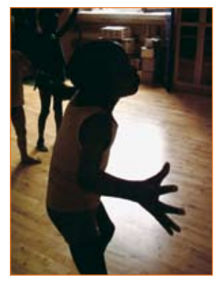
Boy expressing himself through dance