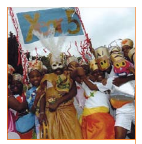
Carnival day at school

teachers and artists to show to children in schools and to teachers at staff meetings.