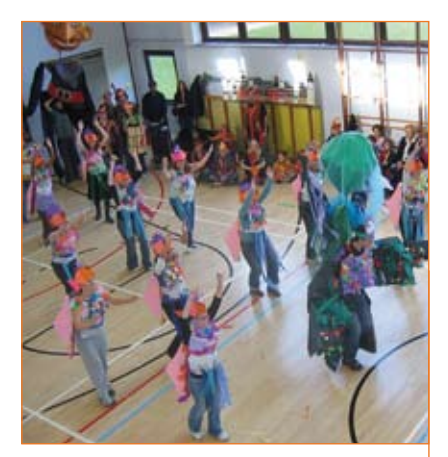
'Under Da Sea' from above - PGCE student carnival