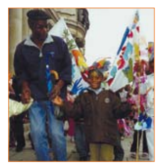
Parents and children in carnival on the streets