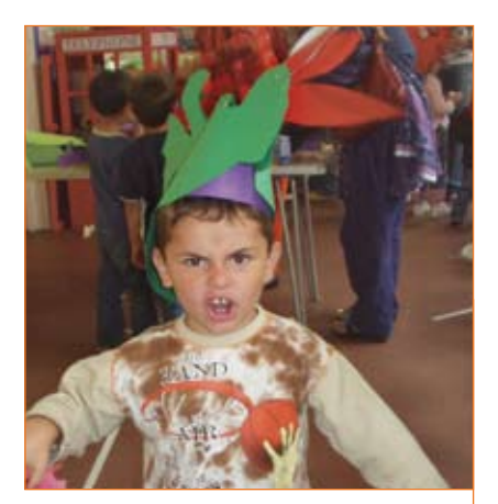
I'm a dragon!