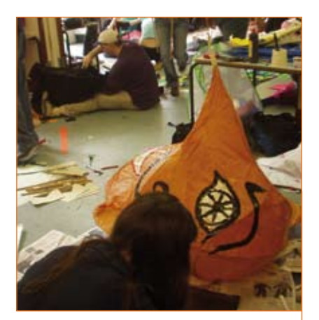
The challenge of scale