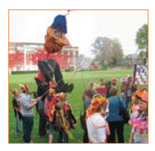
Students parade as Guy Fawkes at Goldsmiths