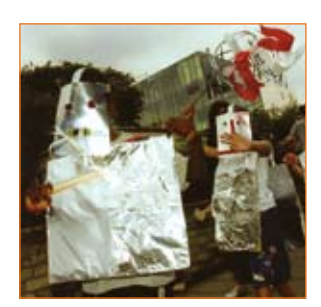
School carnival day 'The Iron Man'