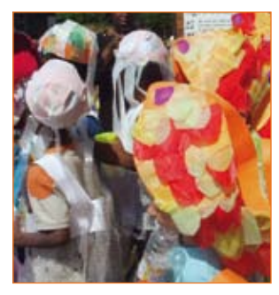
School carnival parade

sense of achievement when the performance took place.