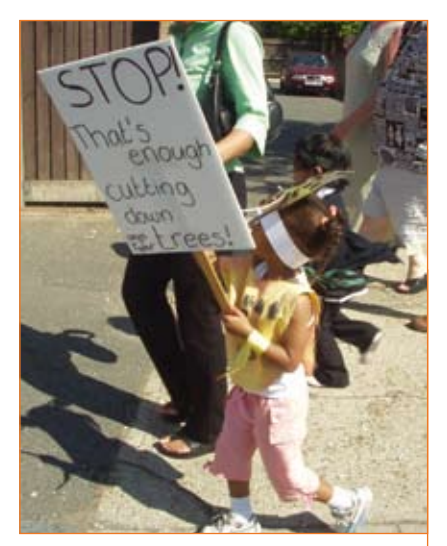
Parent and child make an environmental statement through carnival