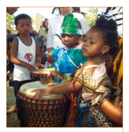
Inclusion: every child can be involved in carnival