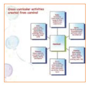
Early years curriculum map from students planning

Students' children took part in the workshops