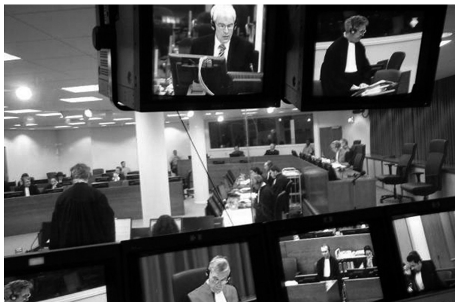
FIGURES 5.9–5.10 Audio-visual technology used in the Trial Chamber.