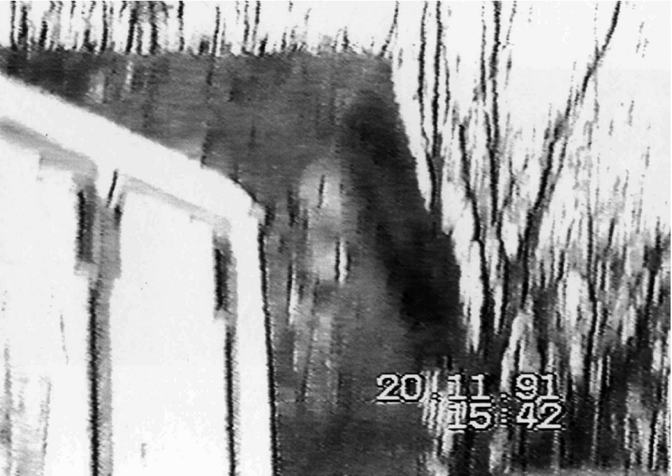
FIGURES 5.2–5.3 IT-95-13a: Dokmanovic [MPG] Video segment of alleged locations depicted on exhibit D2 at 15:36 and 15:42 Document Type: Exhibit 231 • Date: 18/06/1998 • By: Prosecution.