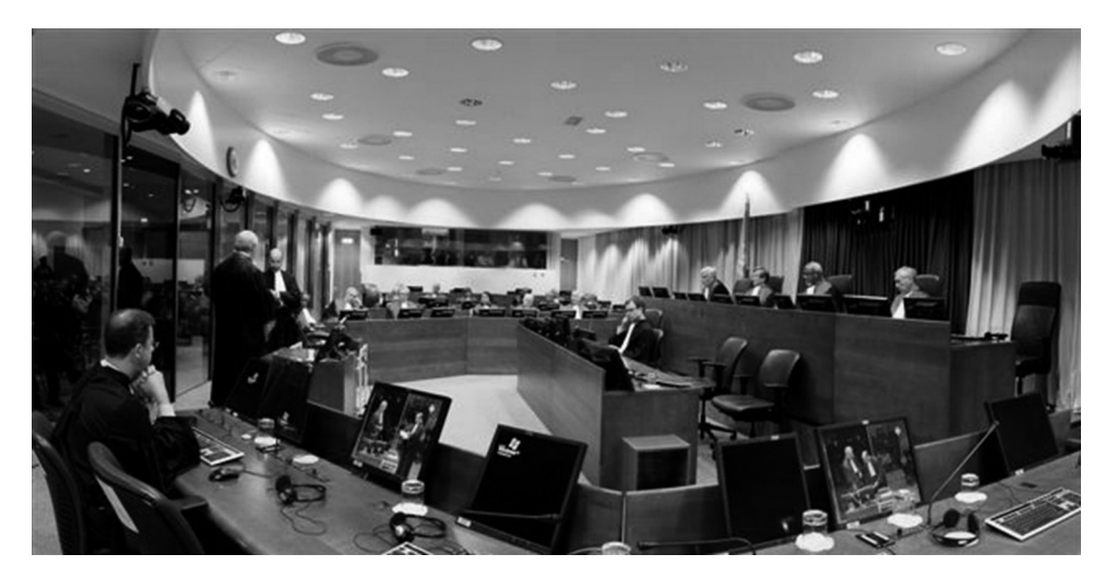
FIGURE 5.4 Courtroom of the International Criminal Tribunal, during a swearing-in ceremony of judges.

Although the ICTY Court Records represent its unrestricted public offerings, they are but a small fraction of the actual materials gathered and records produced by the tribunal since its inception in 1993. Full disclosure of all its legal materials with provisions for protected witnesses remains one of the tribunal's core ambitions, though there has been much dispute as to where and how such a permanent facility should be located and