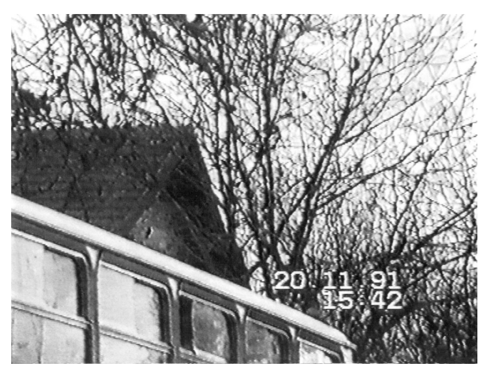
FIGURE 5.1 IT-95-13a: Dokmanovic [JPG] Video still of Exhibit D2 at 15:42 Document Type: Exhibit 217 • Date: 17/06/1998 • By: Prosecution.