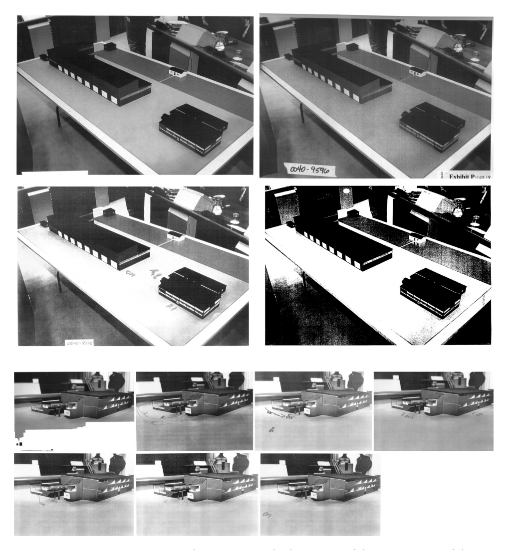
FIGURES 5.11–5.21 IT-99–36: Brdjanin [JPG] Multiple versions of the same picture of the Omarska model, considered the most notorious concentration camp of the Bosnian war, that have been variously copied, cropped and/or marked by witnesses. Document Type: Exhibit P1128.18.

narrative from a savage attack upon King to a perceived threat of violence towards the officers. By virtue of conducting a frame-by-frame analysis and stripping the video of sound, the jury was spared its visceral violence. An acquittal ensued and riots erupted throughout Los Angeles (Sherwin 2007). To undergo the proceedings of the court is, on some level, to endure a certain kind of socially acceptable violence, albeit one whose operations are in principle oriented towards the production of justice. The same can be said to hold true for material artifacts that enter into its prosecutorial machinery and are submitted to its legal rites of passage (Figures 5.11–5.21 and Figures 5.22–5.23).