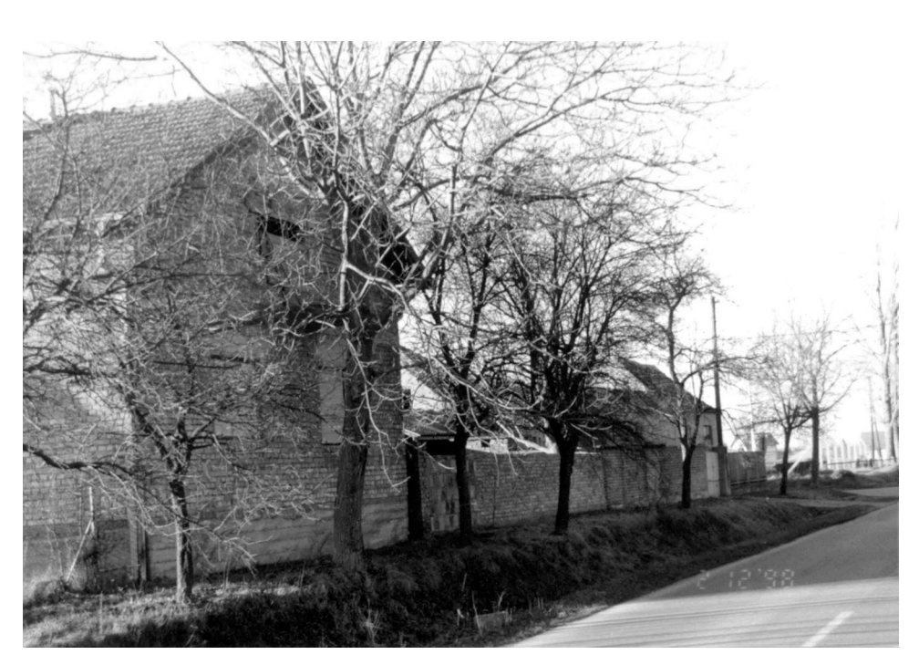
FIGURE 5.25 IT-95-13a: Dokmanovic [JPG] Photograph taken by witness on February 12, 1998, depicting house at the alleged location recorded on Exhibit D2 at 15:42 • Document Type: Exhibit 226 • Date: 18/06/1998 • By: Prosecution.