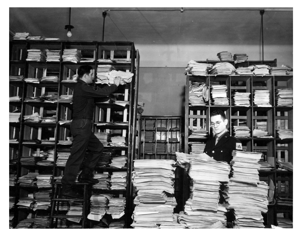
FIGURE 5.24 US Army staffers organize stacks of German documents collected by war crimes investigators as evidence for the International Military Tribunal. Nuremberg, Germany. November 20, 1945—October 1, 1946.

context for working through the notion of the "material witness," the concept is not pursued as an exclusively legal one, nor do I dwell upon questions of judgment in relationship to the injustices that they mediate. But I do examine the intertwined relations between human and non-human forms of testimony and the capacity of each to bear witness to powerful events as they enter into public discourse as agents of dispute.