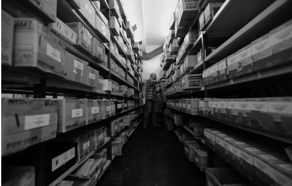
FIGURES 5.5-5.6 Evidence vault of the Office of the Prosecutor OTP.

March 24, 2009.8 Although the charred remains were initially presented inside their sealed evidence bag and placed on the ELMO so that they could be viewed on everyone's desktop monitor, it was determined that the dirty plastic didn't permit sufficient visual access to the material for purposes of reassessment, thus requiring the unsealing of the bag and removal of evidence (Figures 5.7–5.8).