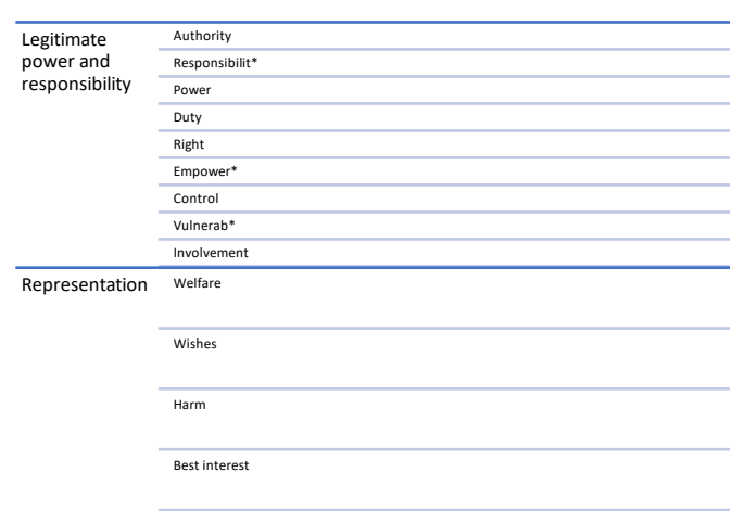
Figure 2. Themes by vocabulary explored in the content analysis and coding

It is worth placing Table 2 and Figure 2 side-by-side. The language used to serve as a mediator and advocate on behalf of the wishes and welfare of children are not overly popular in the documents and often in passing and with varied meanings, as the next sections report. Specifically, the term 'welfare' is used more widely in the Children Act 1989 (n=102) but less so in the Children Act 2004 (n=21) and the Children and Social Work Act 2017 (n=8). Further, the terms 'wishes' and 'harm' only appear under an average of 14.7 and 13.4 times respectively and across the documents. Lastly, the term 'best interest' is only referred to in the Children Act 1989 (n=8) and the Children and Social Work Act 2017 (n=3).