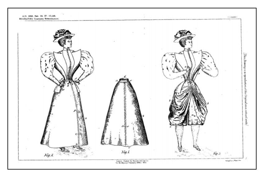
Figure 2. Alice Bygrave's (1895) Pat. 17,145: Improvements in Ladies Cycling Skirts , December 6 (accessed at Espacenet, the European Patent Office, www.epo.org).

long-felt wants of the bicycle woman." These included a straight walking skirt, a slightly raised skirt for use on a woman's step-through frame, and a full conversion to cycle a diamond frame bicycle "with all the grace and utility of a masculine wheelman" (St. Louis Post Dispatch 1896, 22). Another suggested its dual use "for either cycling or mountaineering" (The Lady Cyclist 1896, 49). Bygrave's invention clearly captured the public imagination. While some reviewers stressed its discreet feminine allure, others boldly claimed the masculine freedoms it offered women. Convertible skirts provided not only clothing to ride safely, and a quick change in times of social danger, but also a range of alternate discourses and imaginaries to navigate an expanded range of social, political, and physical landscapes.