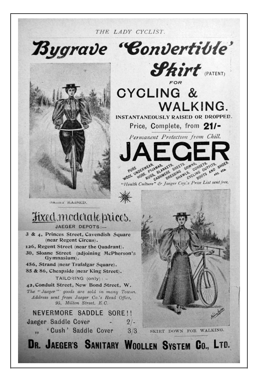
Figure 3. Jaeger advertisement for the Bygrave "Convertible" Skirt, The Lady Cyclist (1896, March), p. I.