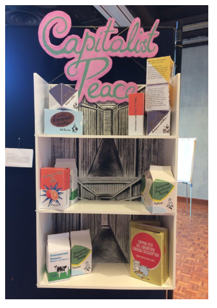
Figures 1a and 1b. Shopping at Capitalist Peace , shown in June 2016 at the Consumer Culture Theory conference, Lille Grand Palais, Lille, France.