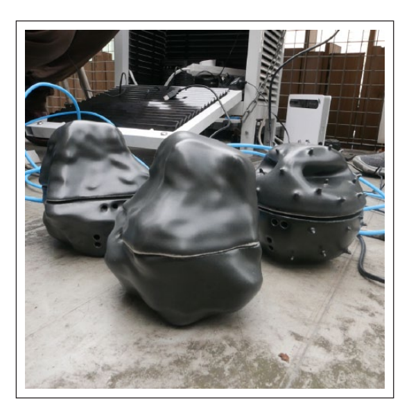
Figure 4. Calibrating the Dustbox particulate matter 2.5 monitor at the Marylebone Road Atmospheric Observatory. Citizen Sense. 2016.

activity, there were 21 active Dustboxes, and consistent monitoring took place at up to 18 sites over a period of 7 months. During the monitoring period, we organized three work-shops to explore emerging patterns of particulate pollution shown in the Dustbox data and to discuss emissions sources and mitigating measures.