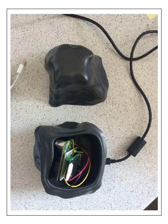
Figure 3. Dustbox particulate matter 2.5 monitor. Citizen Sense, 2016.

practices that present various technical-political entanglements emerging from multiple genealogies.