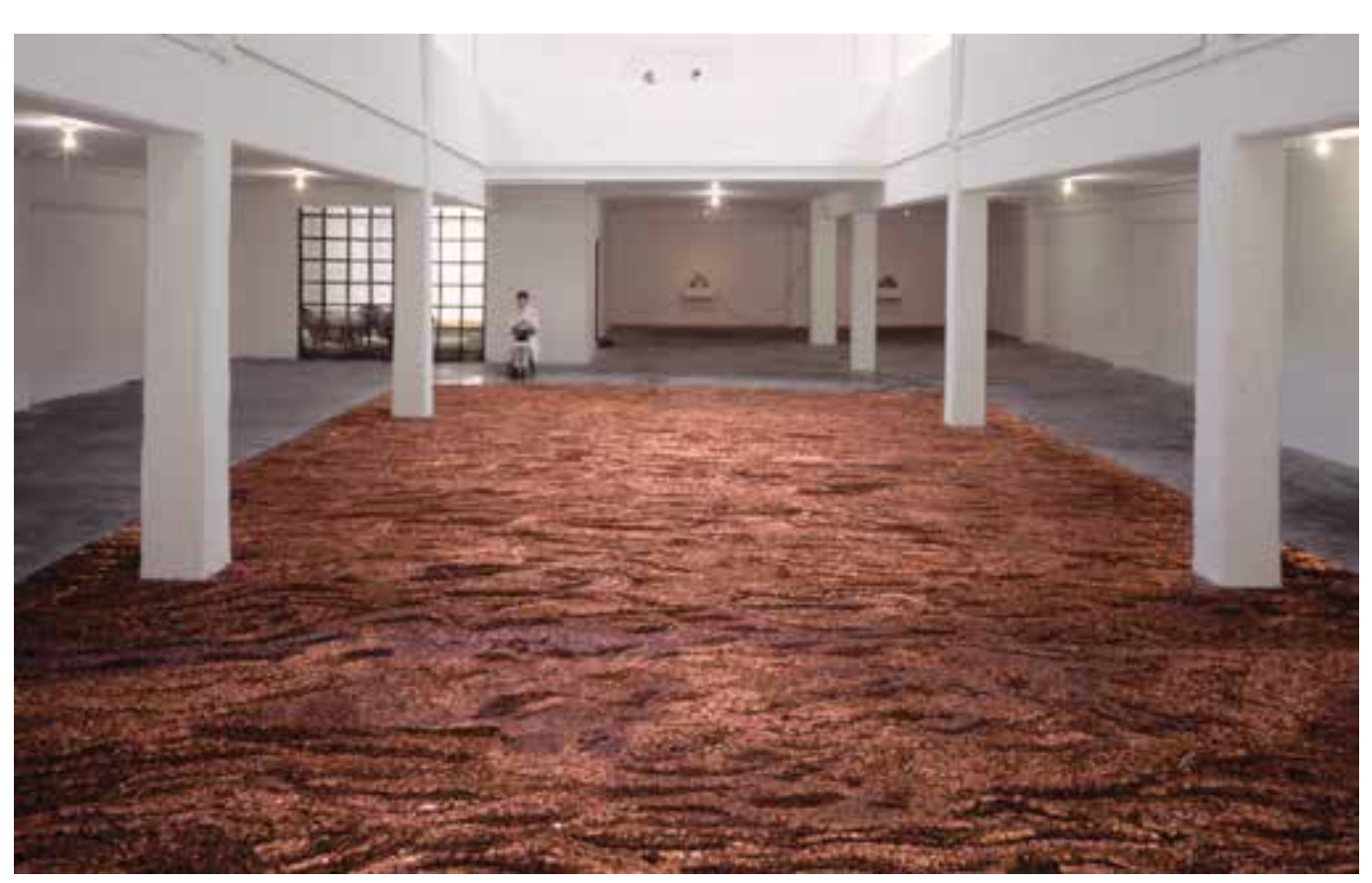
Ann Hamilton, Privation and Excesses , Capp Street Project | San Francisco, CA, 1989.

but with variously composed materialities that form confederations. In revealing similarities across categorical divides and lighting up structural parallels between material forms in "nature" and those in "culture," anthropomorphism can reveal isomorphisms".<sup>22</sup>