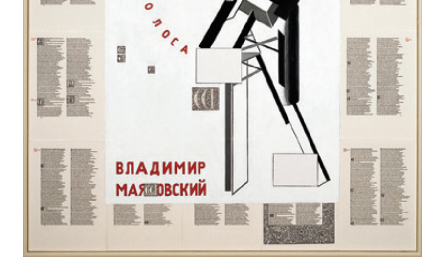
Figure 7. David Mabb. Announcer 2, 2013. Paint on paper, 148 cm x 168 cm.