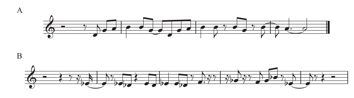
FIGURE 2. Items eliciting the highest average "old" ratings (A: Under the Boardwalk, The Drifters, 1964) and the lowest average "old" rating (B: I Wanna Dance with Somebody, Whitney Houston, 1986).

When comparing the two models we note that there is only limited overlap in the precise features selected as explanatory variables. However, "old" judgments seem to be driven by rather similar features in both models: Features that indicate the use of infrequent motives are associated with high ratings on the recognition scale. In fact, the features mtcf.norm.log.dist (from old-item model) and mtcf.TFDF.spearman (from new-item model) are conceptually related and measure the association between motivic frequencies in a corpus and a given melody item, albeit using different techniques (i.e., distance computation and rank-based correlation). Thus, the relationship between infrequent motives and "old" judgments holds true for old items and new items alike. And in fact, when we pooled hits and false alarms in our data across the 80 items we obtained a significant positive correlation of participants' explicit ratings over old and new items of r = .34, t(78) = 3.16, p = .002, 95% CI [.137, .518] confirming that certain items generate "old" judgments regardless of whether they were heard before or not.